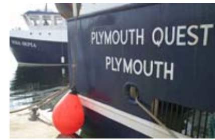
Plymouth Quest MBA Sepia