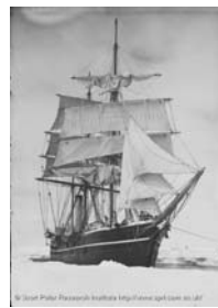
Scott of the Antarctic