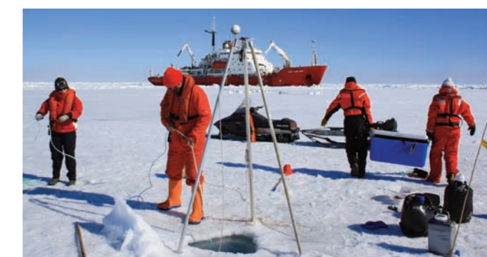
Collecting samples at a sea-ice station (80°N, 5°E) in the Greenland Sea, with the RRS James Clark Ross in the background, during the Oceans 2025 ICECHASER II expedition, June 2010.

Science highlights included novel eddy correlation measurements of O 2 exchange between sea-ice, water and sediments, the investigation of a newly discovered sea-ice CO 2 pump, the collection of palaeo-records spanning 25,000 years, and the first open ocean use of the SAMS REMUS AUV. The expedition also attracted media coverage by the BBC.