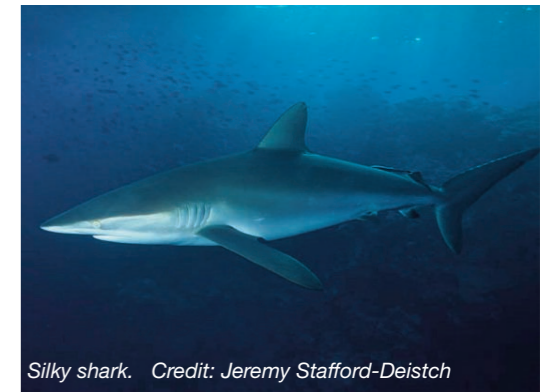
Silky shark.