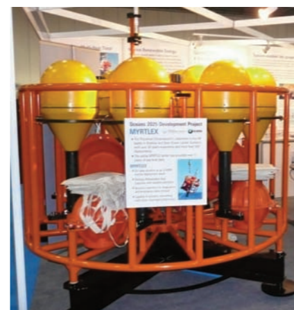
Fully assembled MYRTLEX lander at Oceanology International, London, March 2010.

*MYRTLE – MultiYear Recoverable Tidal Level Equipment